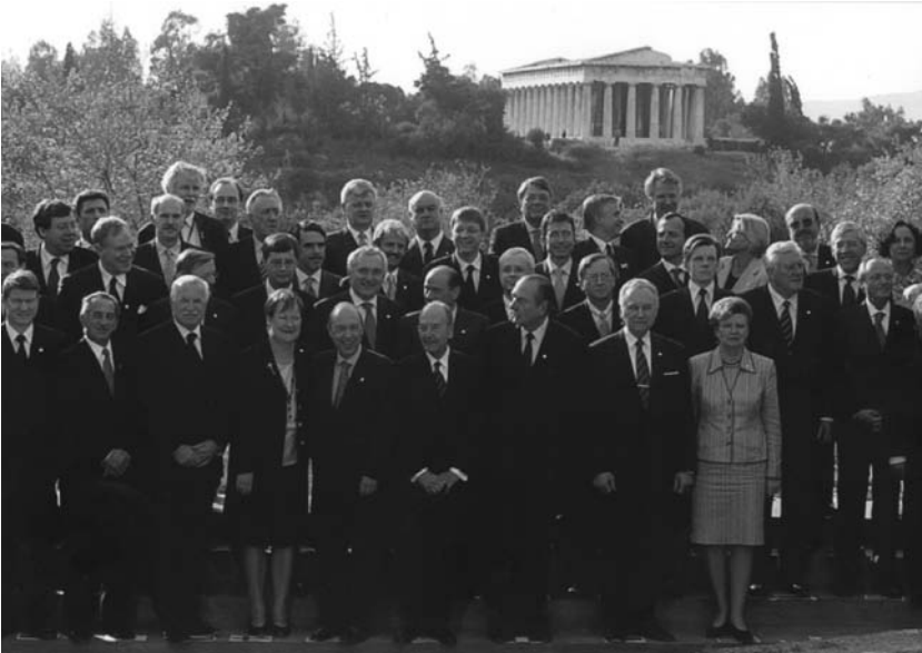
Figure 12.2 The 2003 European Union summit in Athens. Greek Prime Minister, Costas Simitis, in the middle of the first row, brought Greece into the Economic and Monetary Union in 2002

the barren islet of Imia which is part of the Dodecanese complex and hoisted a Turkish one in its place. Greek soldiers replaced the Greek flag and the incident was deemed as innocuous by the Greek foreign minister Theodore Pangalos until the then Turkish prime minister Tansu Çiller herself laid an official claim on the islet and began a confrontation that almost led to war. The crisis was defused through US mediation but a claim on territory was added to the overburdened agenda of Greek–Turkish problems.